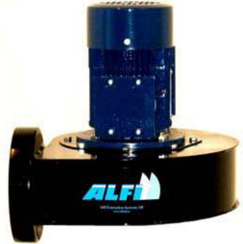
A fans Static pressure vs. Air flow